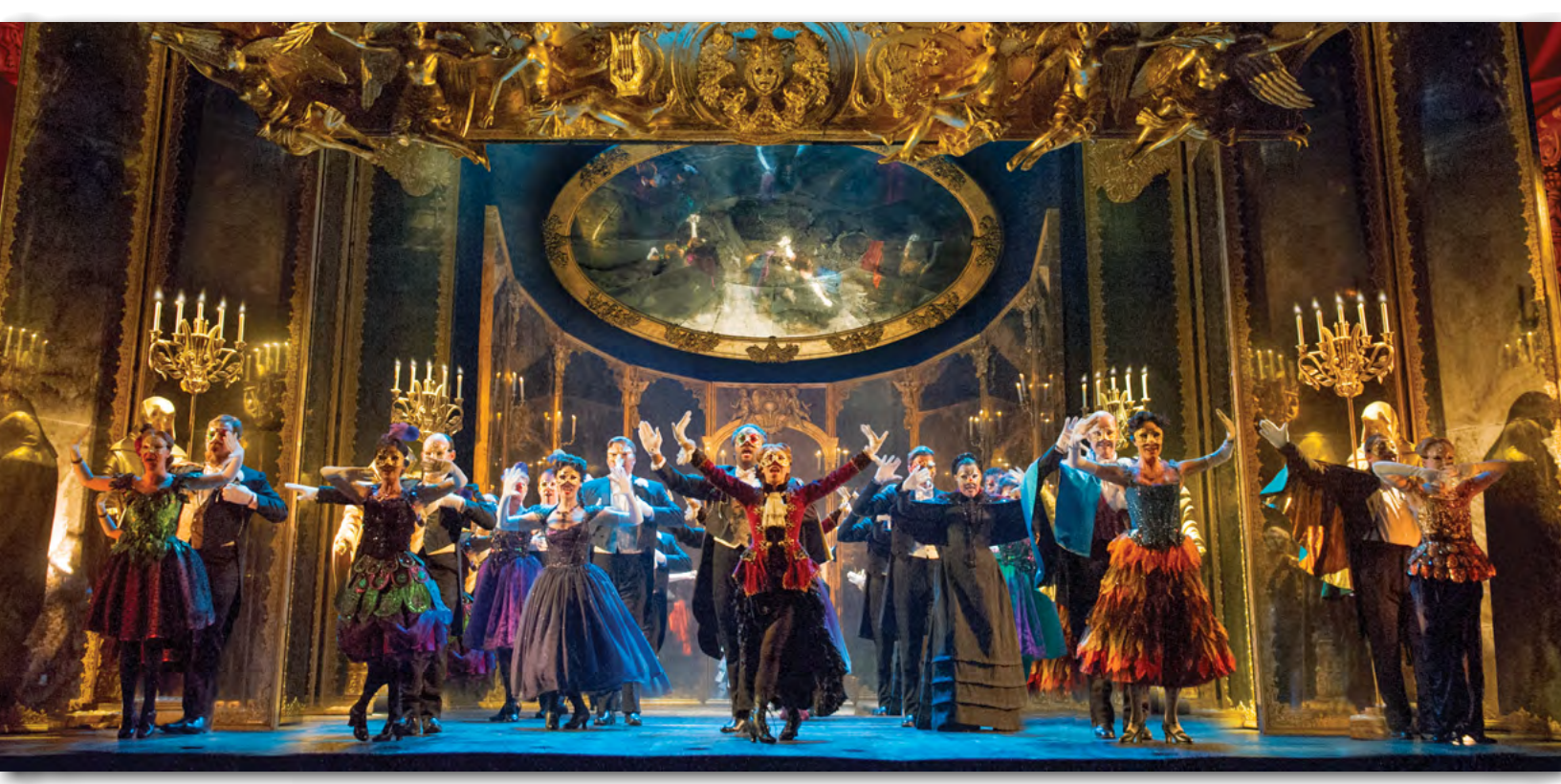
The Company performs "Masquerade."