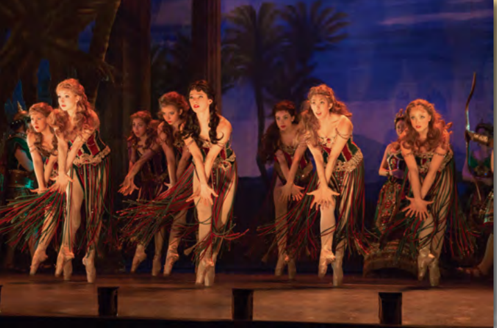
The Corps de Ballet in "Hannibal" - Choreography by Scott Ambler.

The Opera House would eventually have 17 floors, 80 dressing rooms, and a total of 2,500 doors. Along with the lake, water from which was often used to power the hydraulic engines needed to move the scenery, there was a permanent stable with enough room to accommodate 6 coaches and 50 horses!