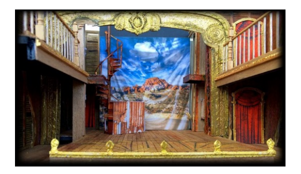
The model box for Crazy for You