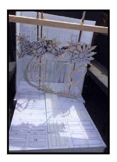
Step 2. White Card

The first step is to research the time period and location of the piece. Often the designer will create a scrap book of images, materials and textures that may inspire their design. Initial ideas are discussed with the director to make sure they fit with the director's overall vision. These can also be given to the production team to help them when bringing the design to life. For example, the designer sometimes draws sketches of how they would like the costume to look and this is given to the wardrobe department as a reference.