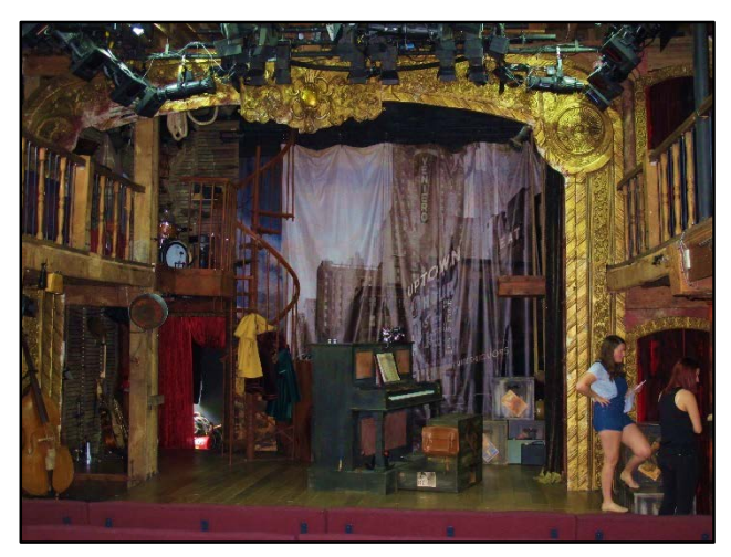
The final set

The carpenter then starts to make the set. At The Watermill the set is built off-site in a large barn in Coventry and then brought to the theatre and constructed during the weekend before the show opens.